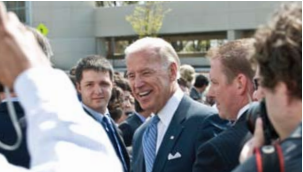
(L) Vice President Joe Biden at groundbreaking of TechVentures 2 . (R) TechVentures 2 under construction.

Vice President Joe Biden joined business and community leaders to celebrate the groundbreaking of Ben Franklin TechVentures 2 on April 15, 2010. Ben Franklin TechVentures 2 will be a 47,000-square-foot expansion to the original TechVentures facility. It will include wet labs, office/meeting space, and parking.